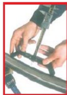
✓ Radius measuring kit