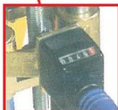
✓ High precision mechanical counter for repeatability of lifting roller positioning